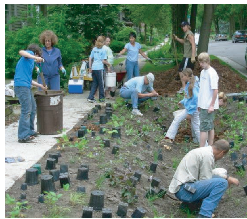
Planting a Raingarden