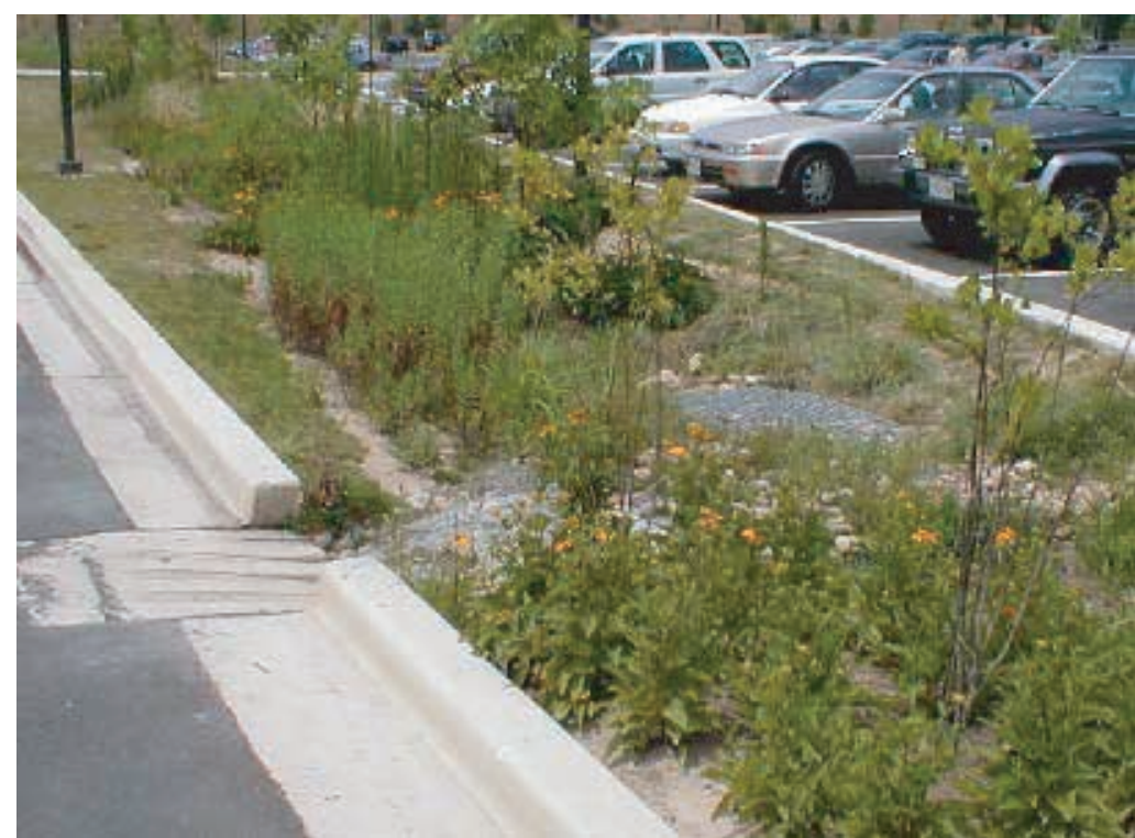
Raingardens filter and cool stormwater.

DURING RAINSTORMS the plants keep water from eroding the valuable soil in the garden.