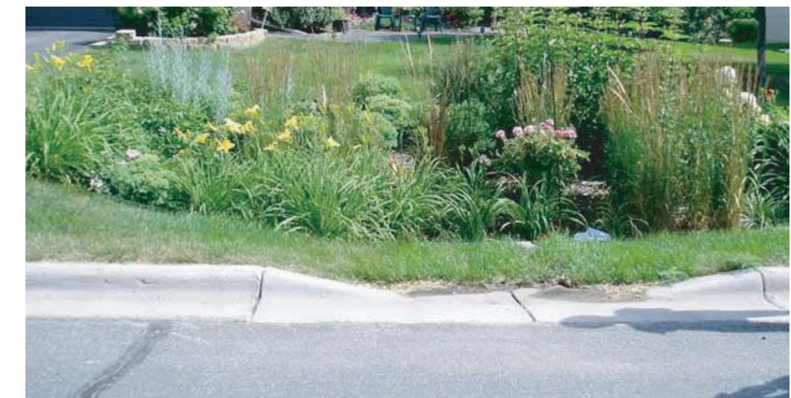
Raingarden in bloom

Planting for a Healthy Community Baltimore Medical System, Inc.