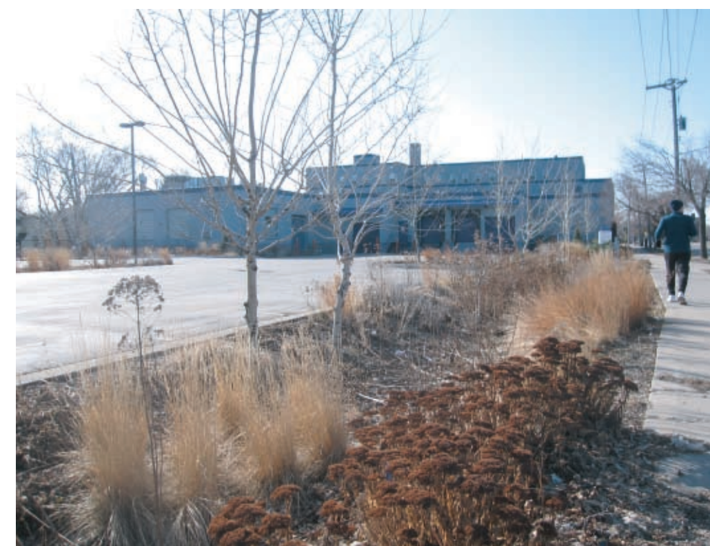
Even in winter, raingardens provide structure