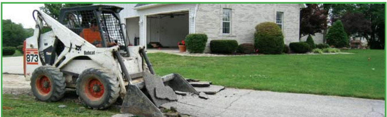
Using an Excavator to Break Up Pavement

There are maintenance requirements for permeable pavement or pavers as well. Please see the Permeable Pavement Stormwater management guidelines for more information.