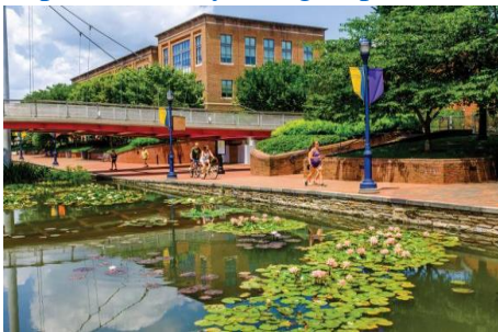
Carroll Creek Park

Carroll Creek Park is a linear park through beautiful downtown Frederick. Spanning more than a mile, this creek walk offers more than just a beautiful view; specialty shops, outdoor dining, breweries and a distillery are among the businesses located along the park -