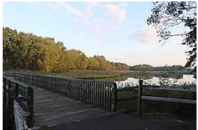
Cross Island Trail

Kent Island Cross Island Trail. The 6+-mile trail, wandering through farmland, meadows, wetlands, and woods, spans from Terrapin Park to the Chesapeake Heritage and Visitor Center at Kent Narrows and now beyond. The trail crosses several creeks with wooden bridges, offering a spectacular view of waterfowl and wetlands. - Senator Adelaide Eckhardt, Delegate Steven Arentz, Commissioner Chris Corchiarino