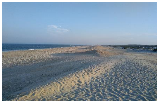
Assateague Island beaches