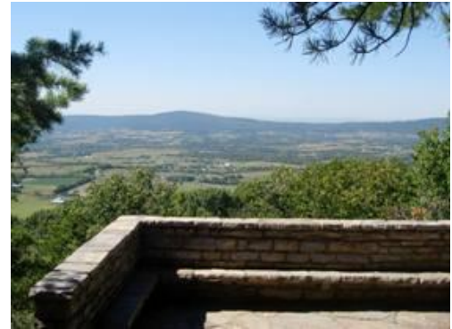
Gambrill State Park

https://dnr.maryland.gov/publiclands/pages/western/gambrill.aspx