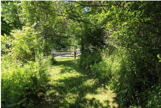
Oakley Cabin Trail

Underground Railroad Experience Trail. The trail was created to provide more pedestrian trails in the community, preserve the rural landscape and commemorate a part of the county's history. Come during Heritage Days in June or Emancipation Day in November. - Delegate Pamela Queen https://www.montgomeryparks.org/parks-and-trails/woodlawn-manor-cultural-park/underground-railroad-experience-trail/