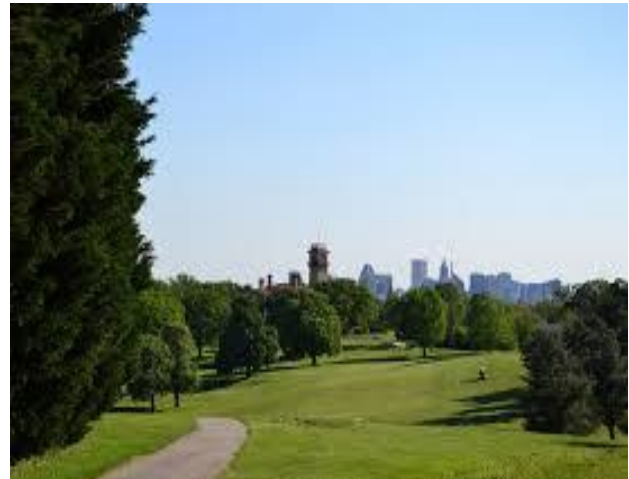
Clifton Park www.parkrxamerica.org