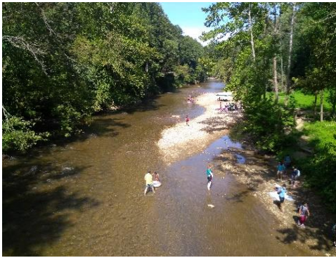
Patapsco Valley State Park