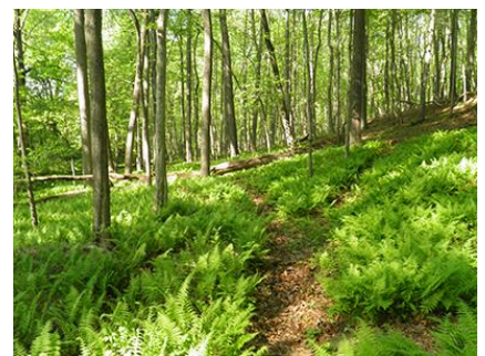
Patuxent River State Park

https://dnr.maryland.gov/publiclands/pages/central/patuxentriver.aspx