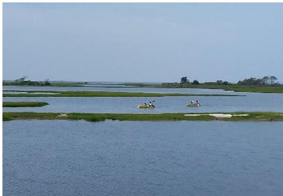
Assateague Island marshes

Assateague Island is a barrier island bordered by the Atlantic Ocean on the east and the Sinepuxent Bay on the west, with land owned by both the federal and state government. Its miles of ocean beaches offer swimming, beachcombing, sunbathing, surfing and fishing. The bayside offers visitors the chance to explore secluded coves by canoe or kayak. The marsh areas have a variety of wildlife, including deer, waterfowl and of course the wild horses. - Delegate Wayne Hartman https://www.nps.gov/asis/index.htm and https://dnr.maryland.gov/publiclands/pages/eastern/assateague.aspx