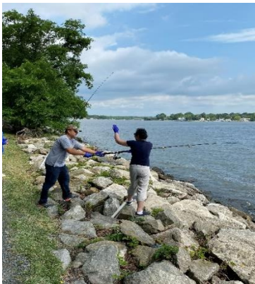
Thomas Point Park