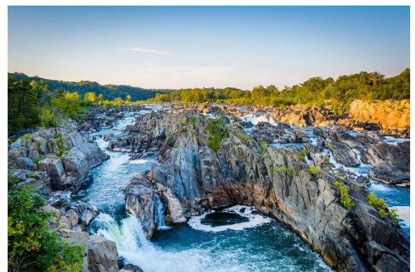
C&O Canal - Great Falls, Potomac MD