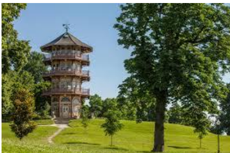
Patterson Park pagoda

Loch Raven Reservoir is one of the most pristine outdoor locations in the Baltimore metropolitan area, with resplendent plants and wildlife and beautiful water vistas, where visitors can enjoy miles of hiking trails that wind their way along the banks of the reservoir. Hikers and bikers can expect to see a wide variety of birds, including ravens, cardinals, blue jays, woodpeckers, and even bald eagles, as well as a lush and varied array of plants and trees, including oaks, beeches, maples, poplars, raspberries, and wild roses - Speaker Adrienne Jones https://dnr.maryland.gov/wildlife/Pages/publiclands/central/lochraven.aspx