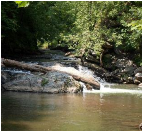
Gunpowder Falls State Park

Soldiers Delight is a 1900-acre space boasting over 39 rare, threatened and endangered plant species and 7 miles of trails. – Delegate Benjamin Brooks. https://dnr.maryland.gov/publiclands/Pages/central/soldiersdelight.aspx