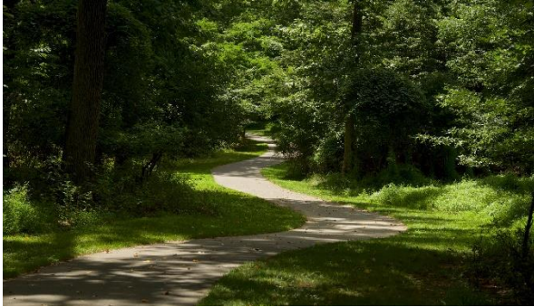
Matthew Henson Trail