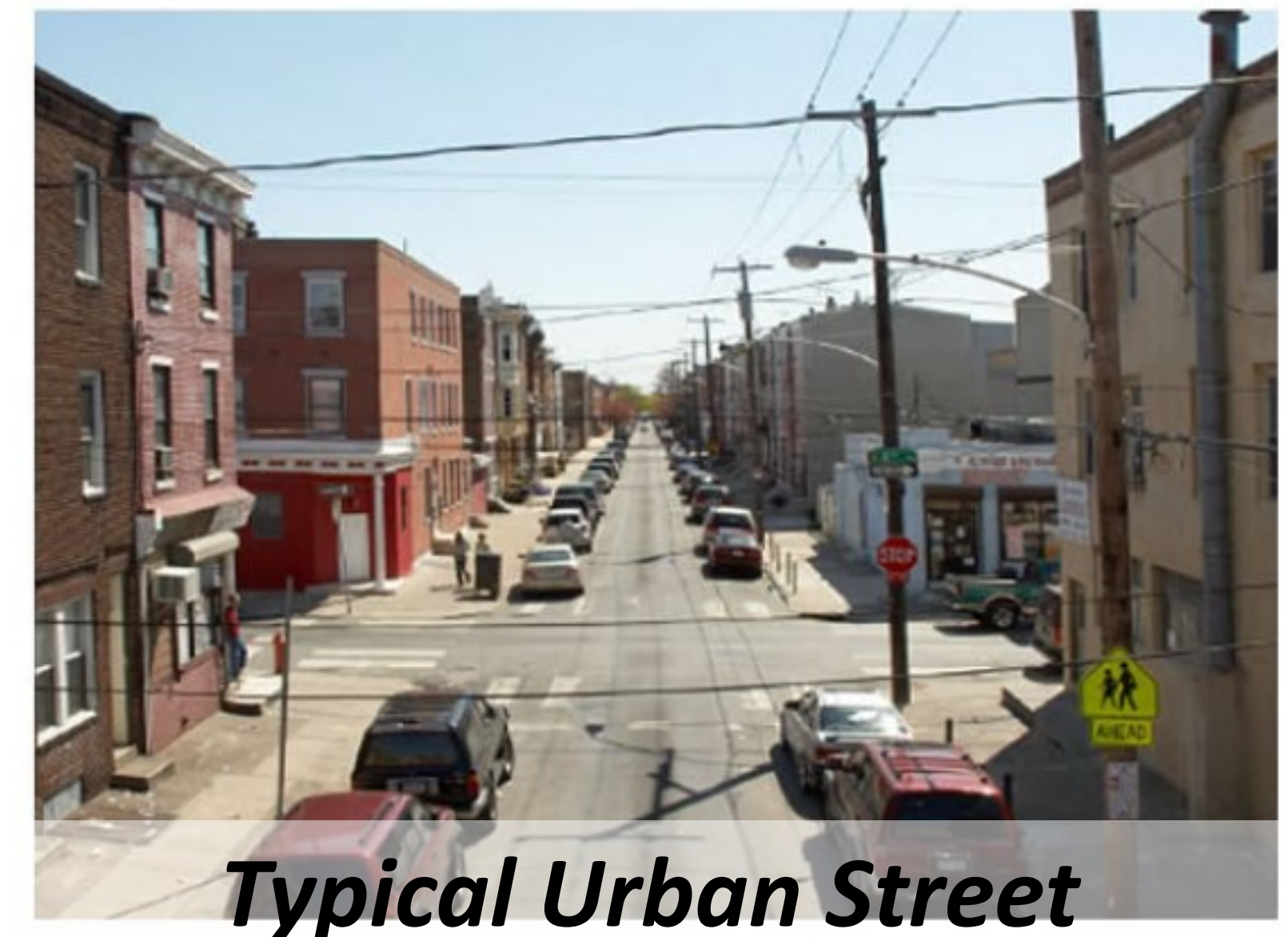
Typical Urban Street