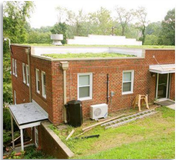
Municipal building green roof