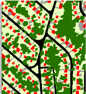
Mapping tree canopy

The Town's efforts continue: Since the completion of this project, Forest Heights has pursued the design of and construction funding for two stretches of its thoroughfares, including Arapoe Avenue, based on support provided by this grant program. In addition, the Town has been aiming to map and increase its tree cover, as part of the Tree Canopy Program. This program will provide green coverage in many places within the town to reduce sun heat exposure, improving air quality by natural methods and erecting trees for a cooler overall temperature. Finally, the Town plans to convert its municipal energy use to solar through installation of solar panels. Much of this work is supported by aggressive and successful grant seeking.