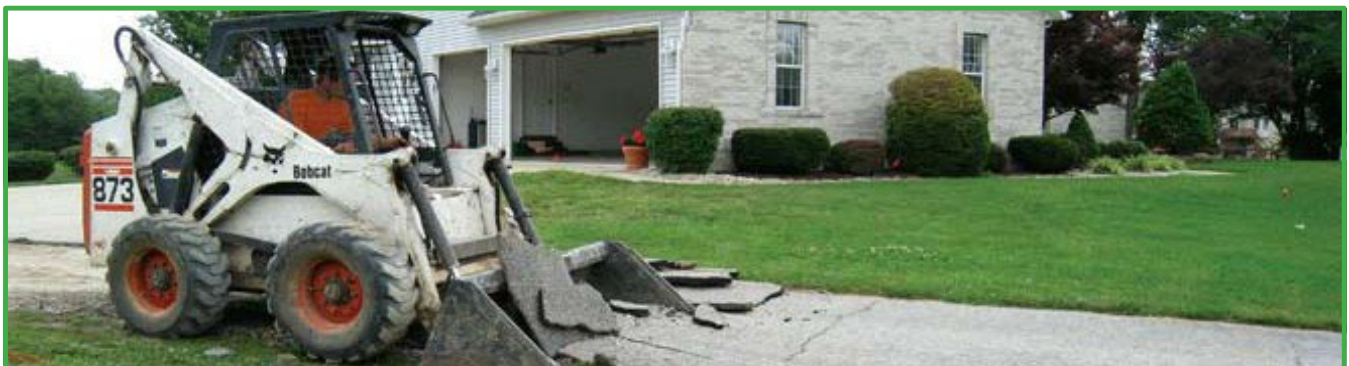
Using an Excavator to Break Up Pavement

There are maintenance requirements for permeable pavement or pavers as well. Please see the Permeable Pavement Stormwater management guidelines for more information.