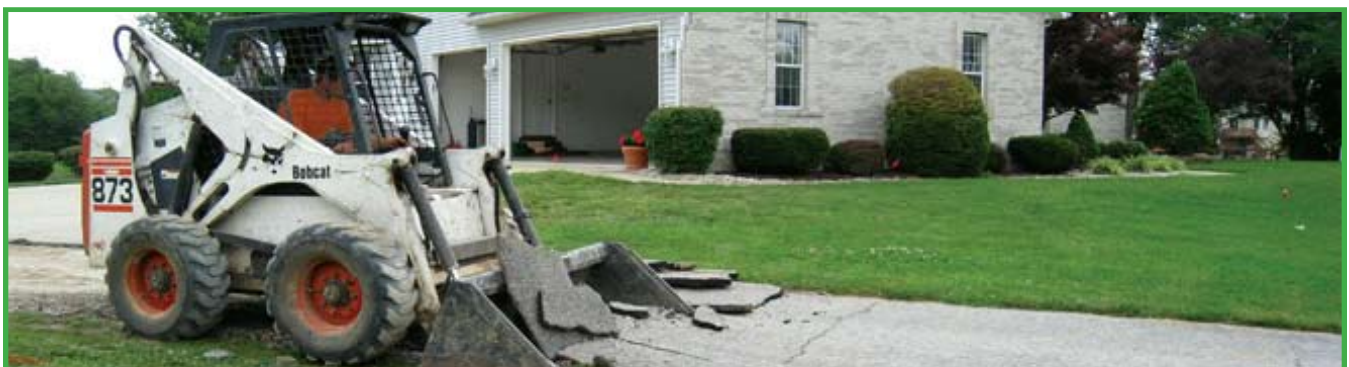
Using an Excavator to Break Up Pavement

There are maintenance requirements for permeable pavement or pavers as well. Please see the Permeable Pavement Stormwater management guidelines for more information.