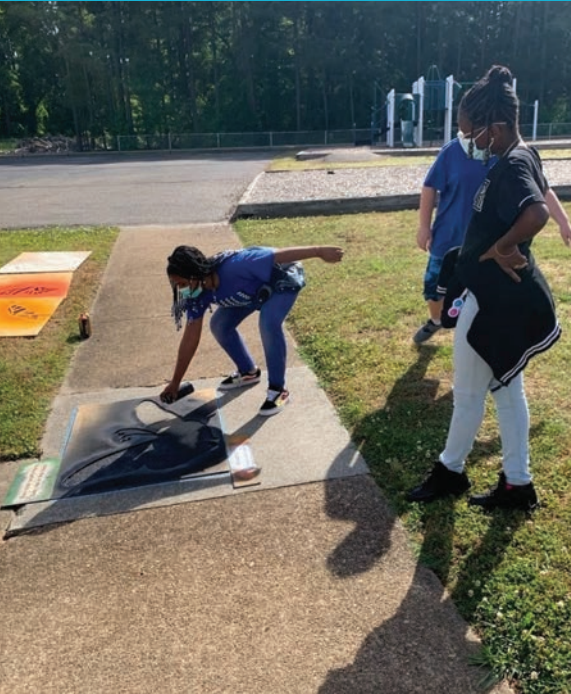
Henrico County Public School students paint storm drains with the James River Association

Boxerwood Education Association, $19,990 to realign and enhance environmental education curricula during COVID