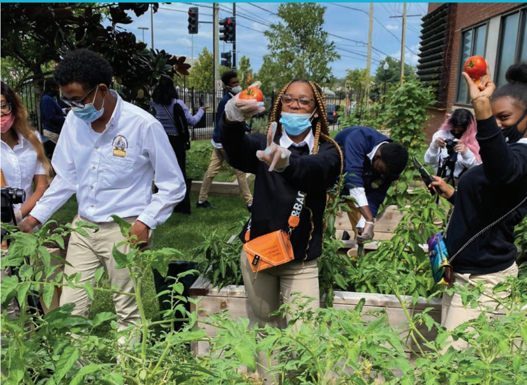
Students with Live It Learn It study how trash pollution affects stream habitats and their inhabitants

National Wildlife Federation, $4,893 to support a partnership of three Ward 7 and 8 churches under the Caring for Creation Program and a rain garden at East Washington Heights Baptist Church