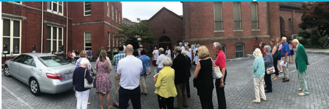
The Interfaith Partners for the Chesapeake worked with several congregations in Salisbury on water quality projects, including this pervious parking lot at St. Peter's.

Ward Foundation, $17,785 for new socially distanced, virtual, and hybrid programs at the Museum