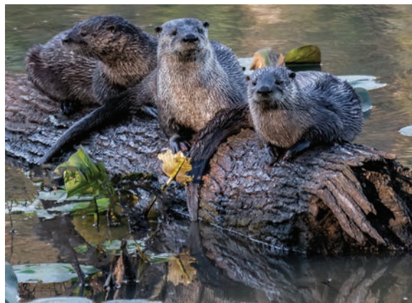
The Smithsonian Environmental Research Center engaged citizen scientists to record data about river otters' behavior and abundance.