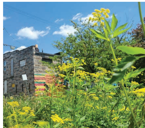
Volunteers at the Amazing Grace Lutheran Church improve their rain garden