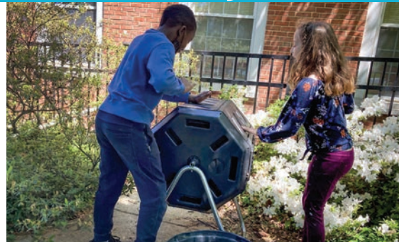
Springwell School students learn about composting and sustainable agriculture.