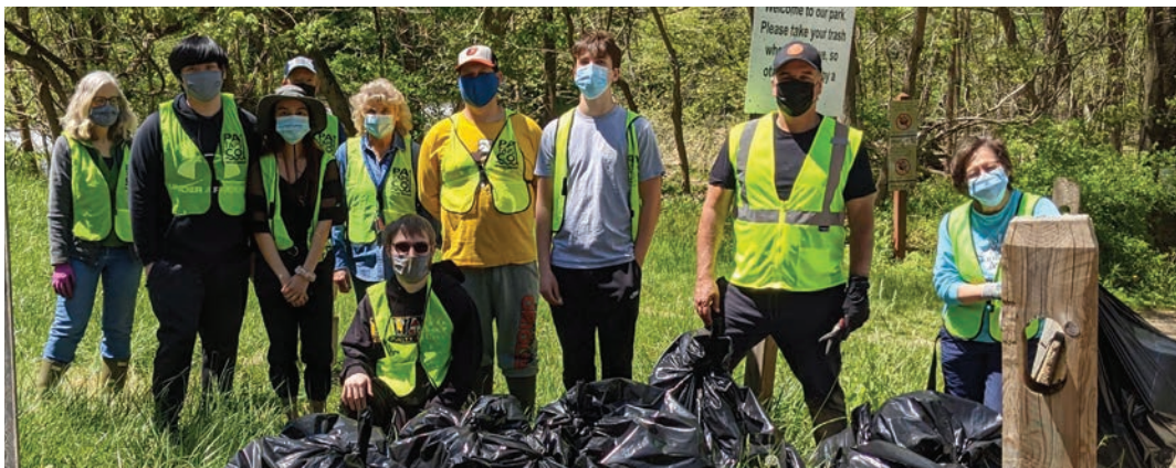
Volunteers finish a day of litter and invasives removal from a stream buffer as part of the Friends of the Patapsco Valley volunteer engagement project

Audubon Naturalist Society of the Central Atlantic States, Inc., $29,983 to train home gardeners and Spanish-speaking landscape professionals to implement native conservation landscape plans