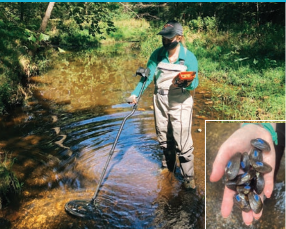
Chesapeake Conservation Corps members with Maryland DNR monitor the Dwarf Wedge Mussel in the Nanjemoy Watershed