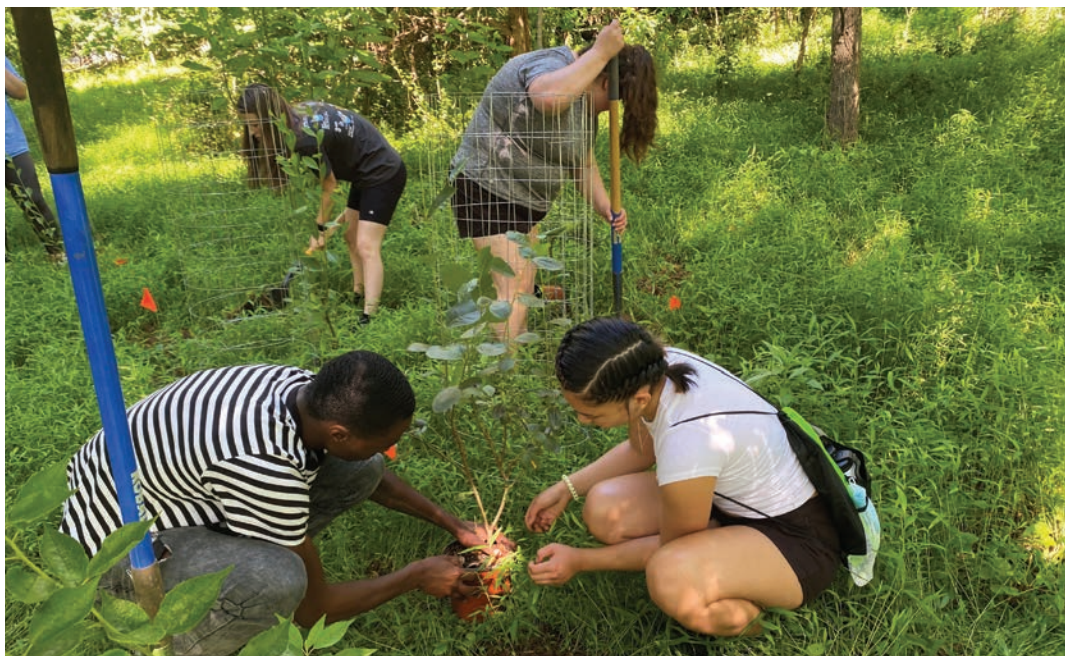
McDaniel College students work on their forest and wetland restoration project.

Defensores de la Cuenca, $21,391 for efforts to promote environmental stewardship within the Latinx community