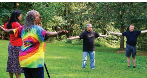
Audubon Naturalist Society's "Service and Healing: Bringing Veterans and Nature Together" program developed a wheelchair accessible trail and developed a "forest bathing" program for veterans.

Friends of Sligo Creek, $60,061 for rain gardens and conservation landscaping at the Carolyn Condominium