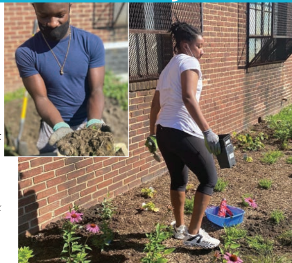
The Youth Champions Club at the Corner Team Boxing & Fitness Center installed a pollinator garden

Immaculate Conception School, $5,000 for field trips for 108 4th and 5th graders to Meadowood Park, Conowingo Dam, and Deer Creek