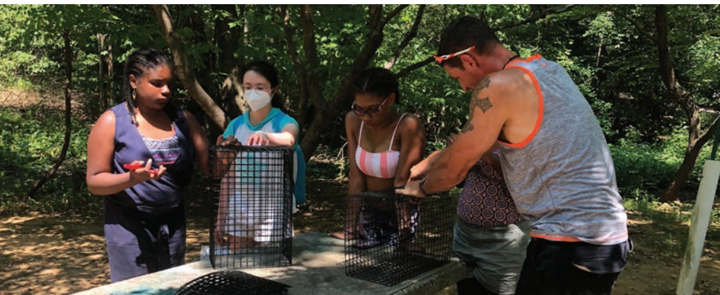
The Oyster Recovery Partnership worked with waterfront communities to build and care for cages for juvenile oysters

Bon Secours Unity Properties, $34,065 for a green workforce program and revitalization of Pacific Park