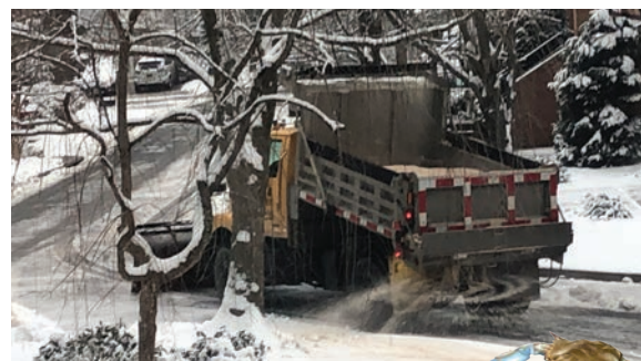
Penn State scientists study impact of deicing techniques on function of stormwater management practices