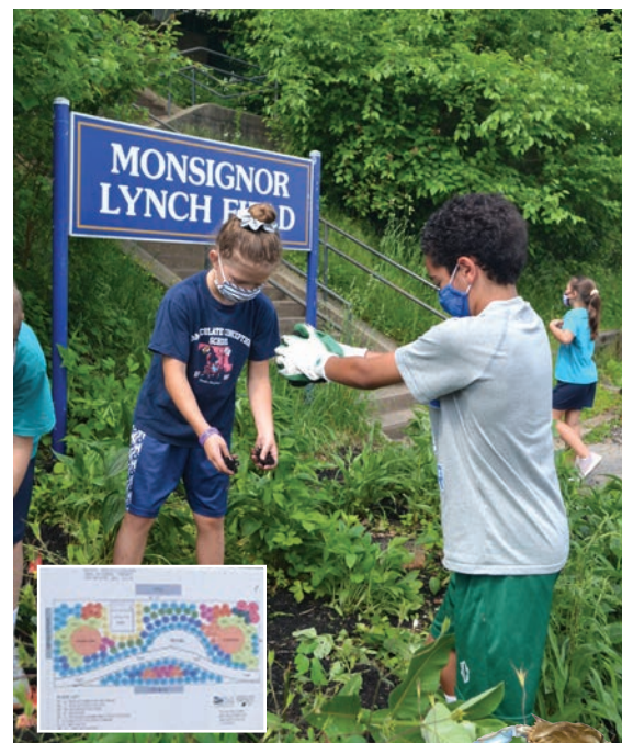
Students at the Immaculate Conception School participate in a planting project