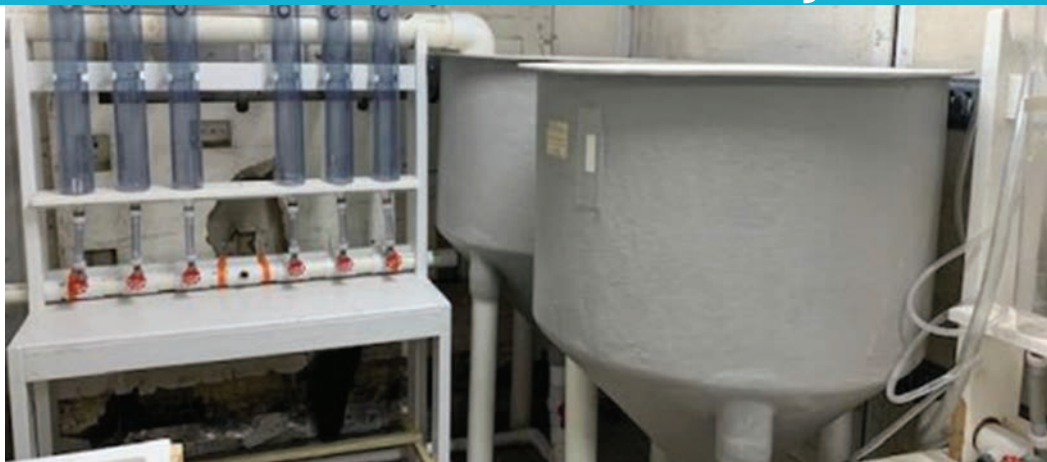
Hoopers Island Oyster Company is working on new technology to foster oyster larval settlement

Maryland Department of Natural Resources (DNR), $1,119 for monitoring and restoration of the federally listed dwarf wedge mussel