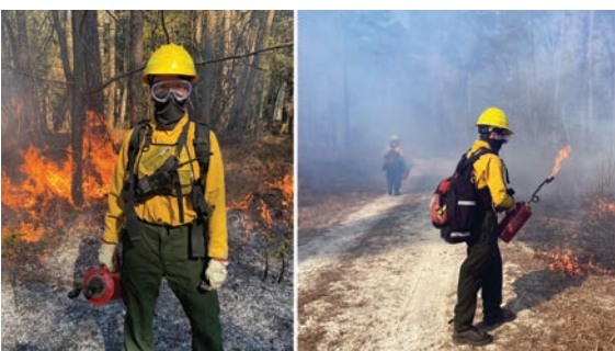
Chesapeake Conservation Corps members with the Nature Conservancy implement a prescribed burn program at Nassawango Creek Preserve, studying effects on carbon sequestration and soil fertility

Blue Sky Fund, $20,000 to shift the Explorers program, which serves Richmond's lowest income neighborhoods, to a virtual format due to COVID