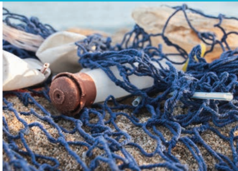
High school students learn about plastic litter with One Montgomery Green

Potomac Riverkeeper Network, Rock Creek Conservancy, and EcoLatinos engaged 1,000 residents in stream monitoring activities