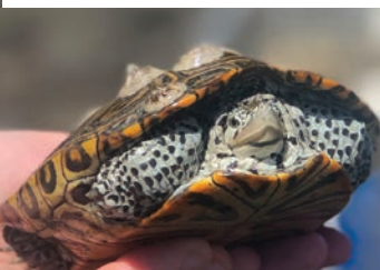
Terrapin nesting sanctuaries were created in Ocean City by the Maryland Coastal Bays Program

Maryland Coastal Bays Program, $1,250 to create a terrapin nesting sanctuary accessible to the public in Ocean City