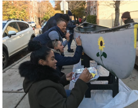
Patterson Park Audubon Center connects Latinx neighbors with natural resources through the Bird Ambassadors program Baltimore, Birds, and the Bay which combines art.

The 6th Branch, $1,022 to expand the Oliver Community Farm sustainable agriculture practice