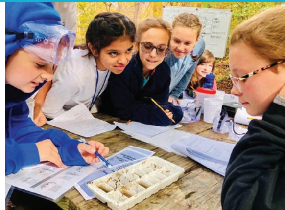
Sixth graders perform hands-on forest, wetland, pond, and stream studies at Camp Puh'tok

Patapsco Heritage Greenway, Inc., $3,959 for tree species signage along a new trail at Patapsco Valley State Park