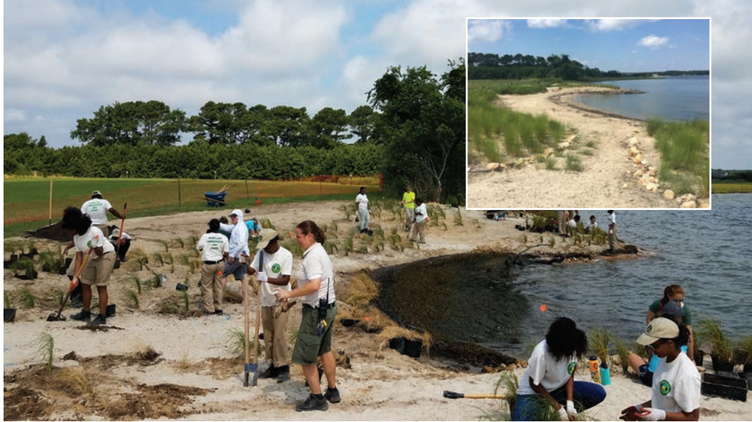
Chesapeake Conservation Corps members plant the Assateague Living Shoreline project through the Maryland Coastal Bay Program to increase climate resiliency, minimize erosion, improve habitat and species diversity, and provide a safe area for recreation.