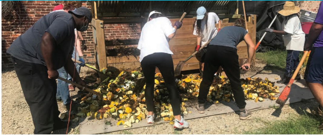
The Neighborhood Soil Rebuilders Composter Train-the-Trainer Program at the Institute for Local Self-Reliance aims to increase community-scale composting at schools, churches, and community gardens.

Maryland Association for Environmental and Outdoor Education (MAEOE), $5,000 to introduce youth to the forestry industry through tree farms