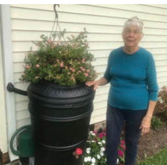
The Stone Gate Townhouse Community Association will encourage residents to use rain barrels and native plantings through workshops, a first step to creating a vision for stormwater management to improve the Wicomico River.

The Ocean Foundation, $49,979 to improve recreational boating practices in the presence of submerged aquatic vegetation (SAV)