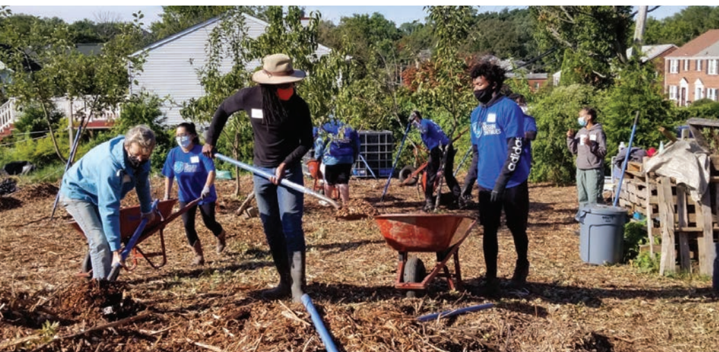
Ridge to Reefs and BLISS (Baltimore Living in Sustainable Simplicity) Meadows worked to reclaim 10 acres of land for an urban farm and reforested space, working towards food justice and equitable access to green space

Asbury Foundation, $5,000 for a conservation landscaping garden and cisterns for the retirement community campus