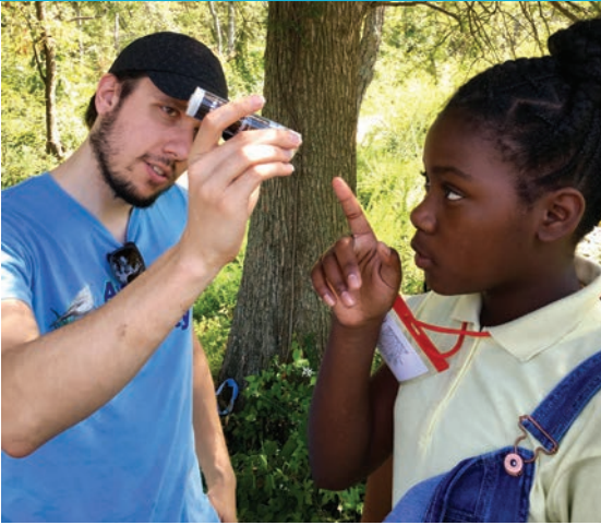
Students with Live It Learn It study how trash pollution affects stream habitats and their inhabitants

Environmental Law Institute, $12,973 to help with legal aspects of development of an innovative water quality financing system