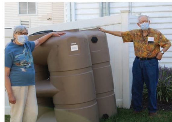
The Asbury retirement community created a conservation landscaping garden and installed 2 cisterns that will harvest up to 230 gallons of water each rainfall