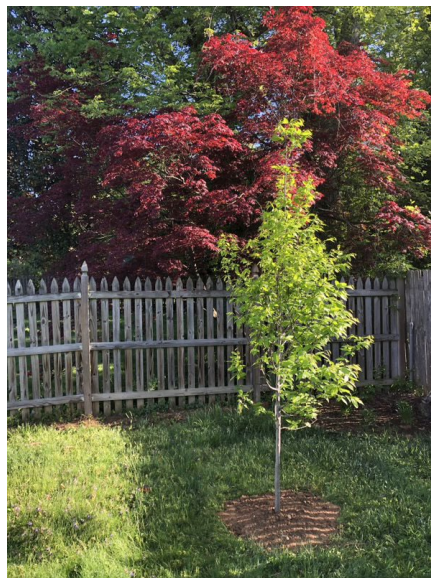
Figures 5 & 6. Native trees planted in the RainScapes Rebate Program.