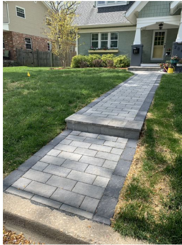
Figures 8 & 9. Permeable Pavers installed through the RainScapes Rebate Program.