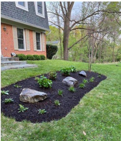
Figure 4. A rain garden installed through the RainScapes Rebate Program.