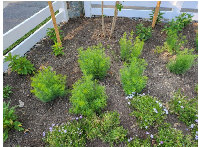
Figures 11 & 12. Conservation landscaping completed in the RainScapes Rebate Program.