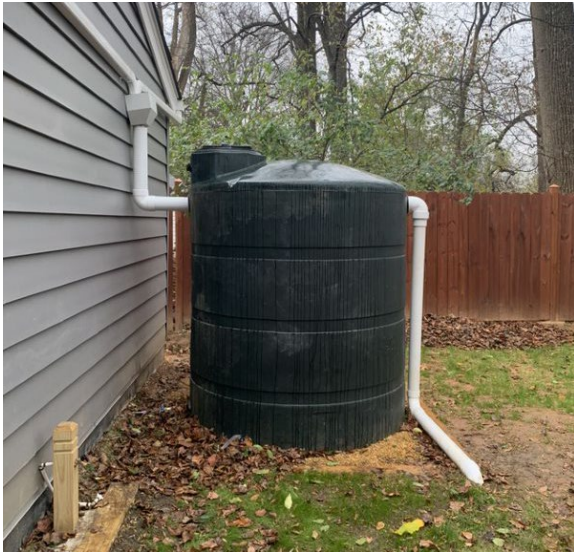
Figure 3. A cistern installed through the RainScapes Rebate Program.