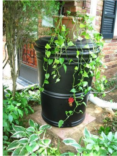
Figures 1 & 2. Rain Barrels installed through the RainScapes Rebate Program.