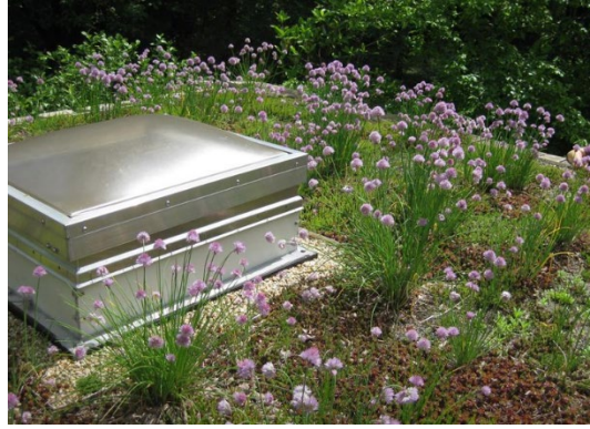
Figures 13 & 14. Example green roof projects installed through the Montgomery County RainScapes Rebate Program. These projects were not funded through this program.