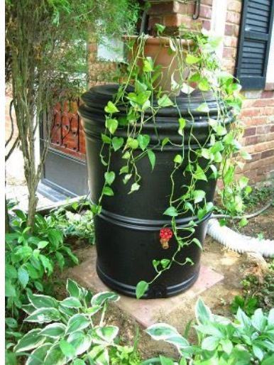
Figures 1 & 2. Rain Barrels installed through the RainScapes Rebate Program.