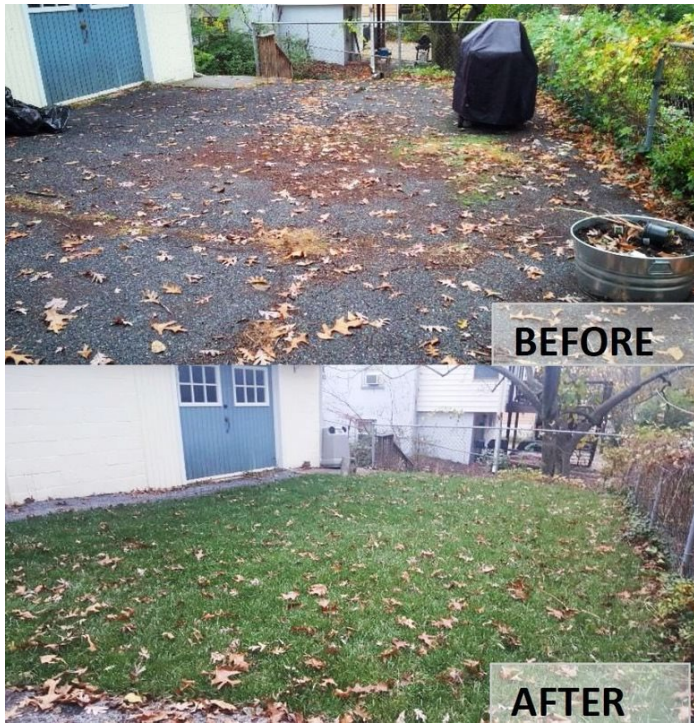
Figure 7. Pavement removal project before and after in the RainScapes Rebate Program.