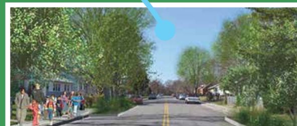
Green street design plan for Minefee Street in the Bellemeade Community led by James River Association