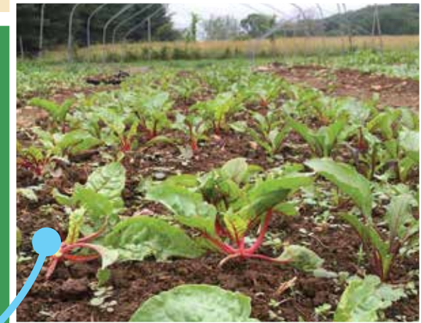
TALMAR Gardens & Horticultural Therapy Center's initiative to provide veterans with skills for employment in agriculture