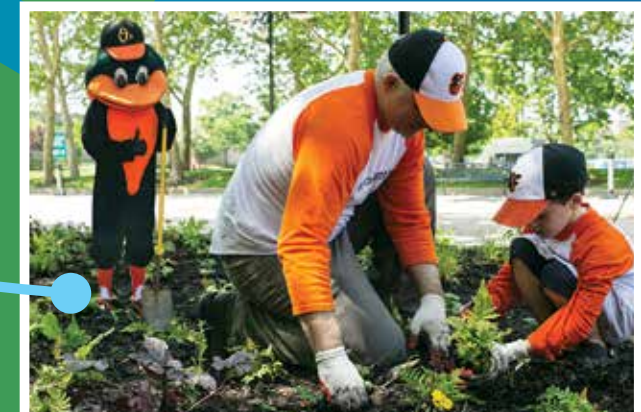
Bird and pollinator habitat garden at Oriole Park at Camden Yards