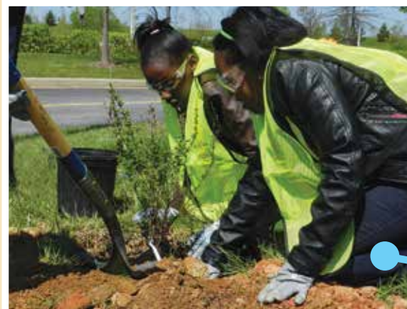
Union Bethel AME Church's bioswale and rain garden restoration project and congregation environmental outreach program

*Funds generated by the Maryland Bay plate and tax-check off are only awarded to projects in Maryland.