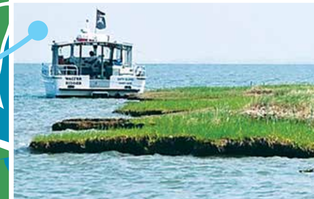
Smith Island United, Inc.'s Watermen's Apprenticeship Program, a community-led and replicable pilot environmental stewardship initiative