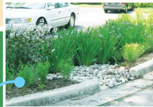
Parking lot stormwater retrofit design at the Salvation Army Harrisburg Capital City