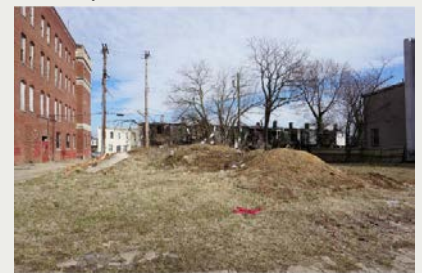
Photo 2. City-owned vacant lots covered in litter along the 3800 block of N. Broadway.

of funding is available), the Greenprint presents improvements in phases based on how quickly and with what resources are available for each layer of implementation. Overall, T6B succeeded in creating a beautiful green plan for the neighborhood, a framework to replicate this type of planning process, and implementation-ready concept designs for real projects which are already underway in Broadway East.