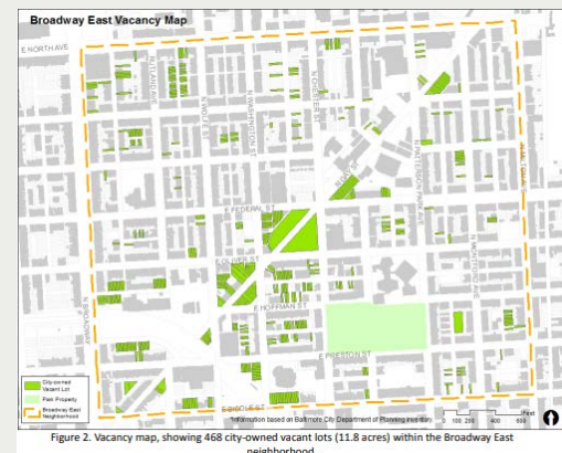
Figure 2. Vacancy map, showing 468 city-owned vacant lots (11.8 acres) within the Broadway East neighborhood.