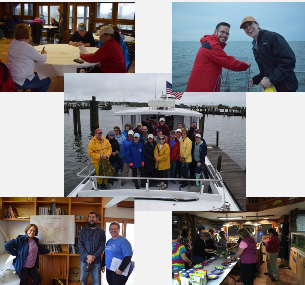
19 Hollifield Station teachers participated in professional development at the Port Isobel Center.